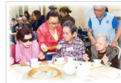
Volunteer carefully helped seniors with their dim sum.