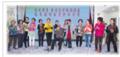
Female volunteers were rooting for harmonica performance by a visually impaired senior.

A warm afternoon in the beginning of December 2016, 120 seniors from our Shamshuipo Integrated Home Care Service Team, Un Chau Neighbourhood Elderly Centre and Bliss District Elderly Community Centre gathered together in a restaurant at Shek Kip Mei. With the company of female volunteers from Sunbright Dance Troupe Limited, the seniors enjoyed delicious dim sum and old songs. One of the seniors with walking aids remarked that he has not been to a restaurant for many years and he looked for more similar opportunities in future. You are welcome to become a volunteer to make the wish of our service users come true.