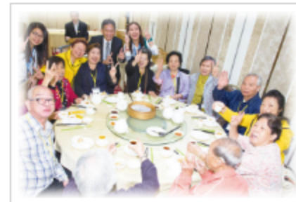
The bright smile lightened up the room with warmth.