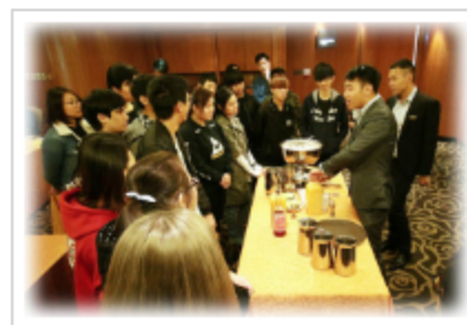
Participants learnt how to mix different beverages.

This activity has greatly enabled young people to get to know about hotel business and some of them expressed their wish to enter into hospitality industry.