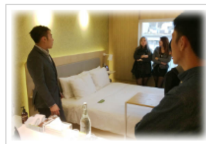
A visit to the guest rooms.