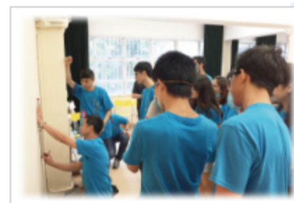
Youth volunteers are learning to assemble parts of cabinet shelves