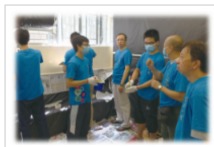
Volunteers of "Team of Care" are teaching youth volunteers wall painting skills