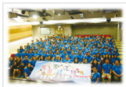
Group photo of volunteers

The second phase of the campaign "Building Your Dream House" was to improve the living condition of 23 families. A workshop was held on 8 October where corporate volunteers taught basic home repairing techniques to volunteers of our Happy Teens Club and "City-Youth Cares about Children" of the City University of Hong Kong. This prepared them for the campaign and equipped them with skills for their future hoping to benefit more people.