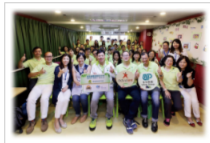
Group photo before getting off

There were 40 families benefited from the activity, we thanked FSC Holdings Limited for their care and concern for the needy.