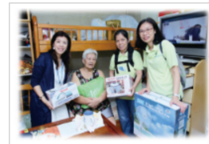
Seniors being interviewed, together with volunteers and our colleagues