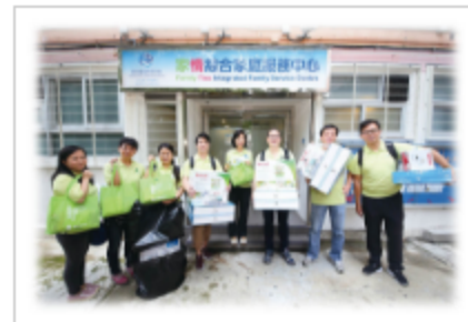
Volunteers are ready-to-go