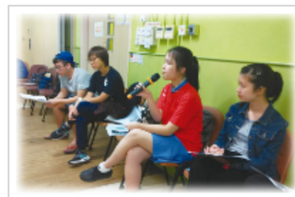
Youth designed different activities for the Legco election.