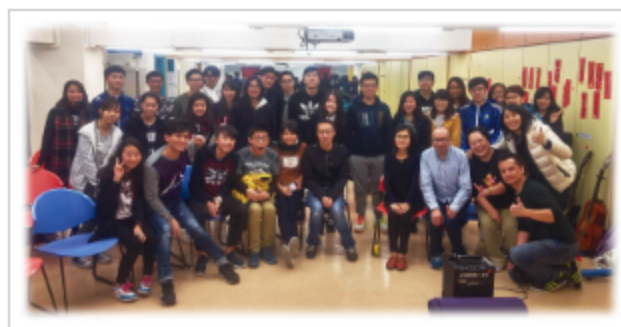
Youth role played Legco counselors to expose the unfair system.

If you have a vote, do exercise your civilian right on 4 September by voting, while our youth would stand in silence outside the polling station.