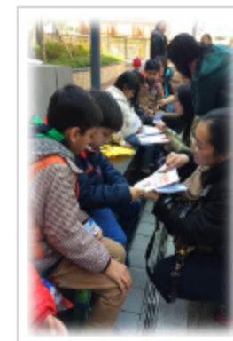
Volunteers assisting EM children to fill in the worksheet