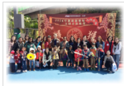
A fruitful trip at the Lunar New Year Fair

Children were delighted, they said "dai gat" when they saw citrus fruit trees, they thought the narcissus bulbs were some kind of vegetables. They also learnt to differentiate different colours of flowers. Some parents expressed that they have never been to Lunar New Year Fair though they have stayed here for four years. They bought some windmills from the Fair for home decoration. After filling in worksheets with the assistance of the volunteers, the Happy Learning Chinese activity was completed and then everyone started off to celebrate the Chinese New Year happily!