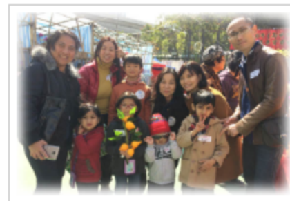
They just learnt "ng doi tung tong"