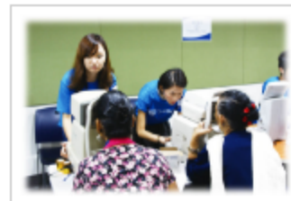
Volunteers are examining the eyes of participants

It may seem ordinary for us to take eye checkup, however, it is no easy task for ethnic minorities (EMs) due to language barrier. We have partnered with Lenscrafters for several years to provide free eye checkups and glasses prescription to keep their eye problems at bay and indirectly improve their quality of life. The eye checkup was held on 21 September where there were more than 40 Ems (including elders and women) of CHEER, ISSA, and Project SEE participated. Our colleagues assisted in translation so that participants could undergo a series of checkup such as: intra-ocular pressure, color-vision assessment, stereopsis, prescription for lens and checkup. There were free prescriptions for glasses for those who are in need.