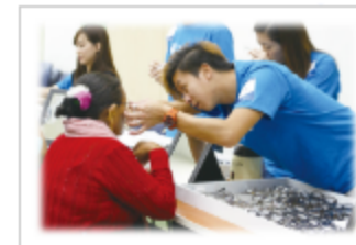
Volunteers are taking the prescription for glasses for participants