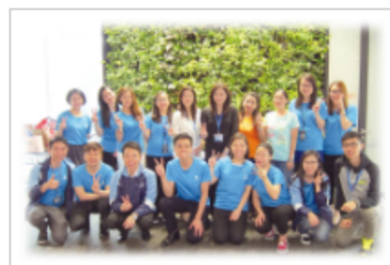
Corporate volunteers visited the elders with gifts

Furthermore, volunteers of Zurich (HK) Insurance Group visited our Wah Hong Home for the Elderly where they spent a meaningful afternoon with the residents on 27 May.