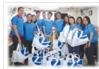
Photo with corporate volunteers, ISSA volunteers and our colleagues.