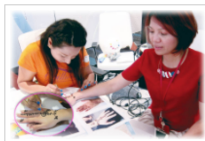
Volunteers did Henna art on participants