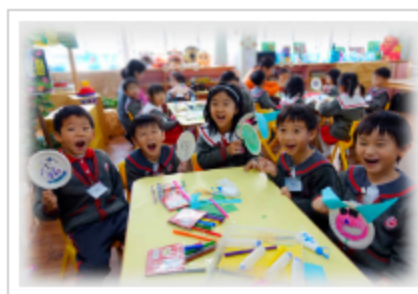
Children are so excited when they created their unique animal masks.