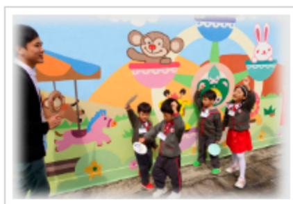
Role play using animal masks made by children and artists

Furthermore, extended workshops on frescos were held from 19 to 26 January 2016 by a team consisted of members of the Group, artist and photographer. Through creation of animal masks with the addition of music element, the children got more inspiration and thoughts on fresco designs.